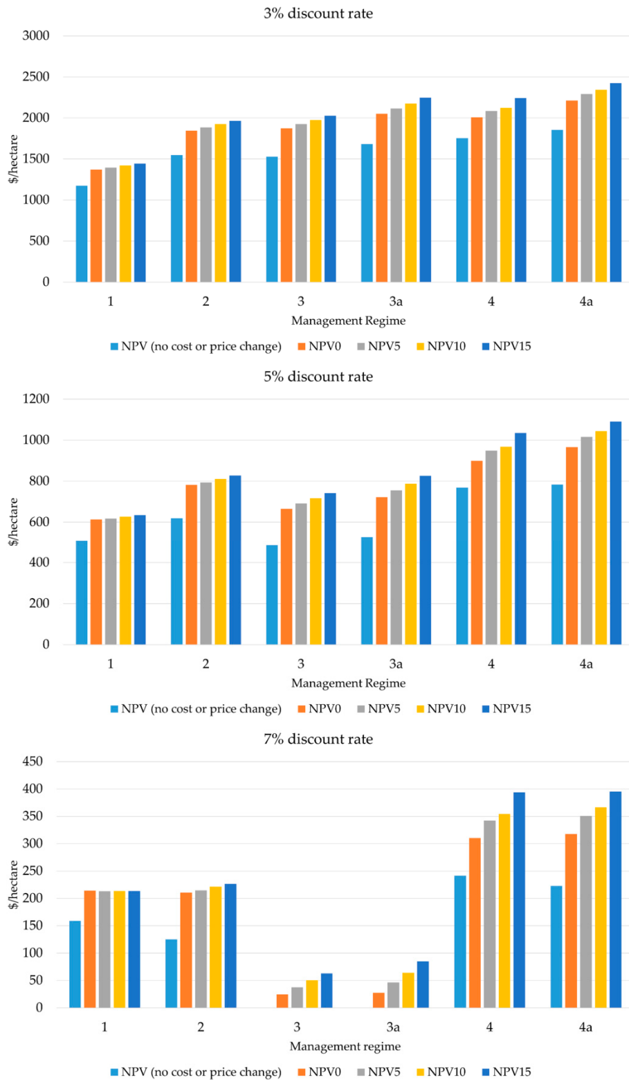
Figure 2. NPV of management regimes at successive establishment points (at the cost base year and 5, 10, and 15 years after the cost base year), assuming change in cost and increasing (0.5% annually) timber prices.